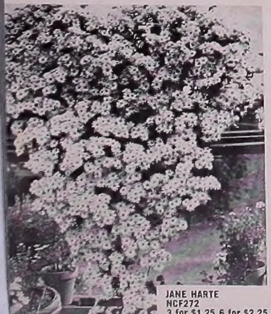
JANE HARTE NCF272 3 for $1.25 6 for $2.25